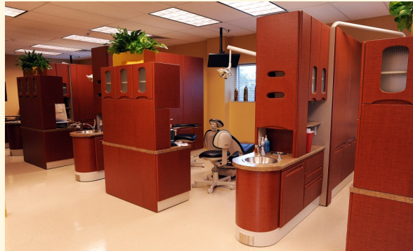
UCF Student Health Services' in-house dental facility

All other services are provided at the UCF Student discounted rate.